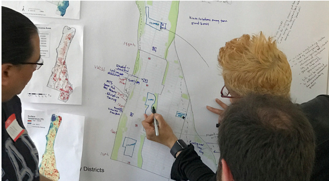
At a scenario-development workshop in New York City's Harlem neighborhood, residents, local leaders, neighborhood organizations, and city agencies came together to develop alternative visions for resilience to extreme climate-driven events such as heatwaves and flooding.

solutions" (2). "It is important for us to share a positive narrative," she says, "and that's been important to the way we think and construe our solutions."